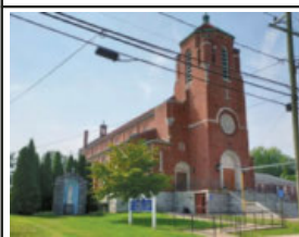
Photo books of St. Adalbert Church are available for pre-order.