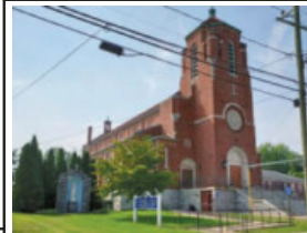
Photo books of St. Adalbert Church are available for pre-order.