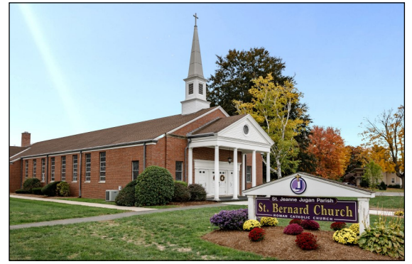
ST. BERNARD CHURCH