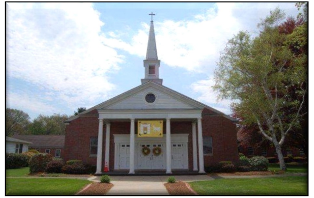
ST. BERNARD CHURCH