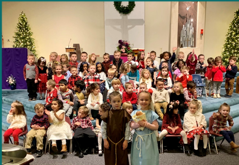
The Little Angels Christmas Concert

For more details, please contact Beth Surapine at 860-749-6801.