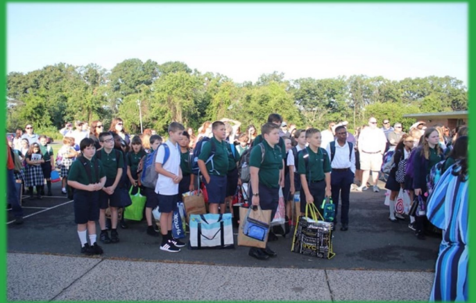
Students gather on the first day of school eagerly awaiting the first bell.