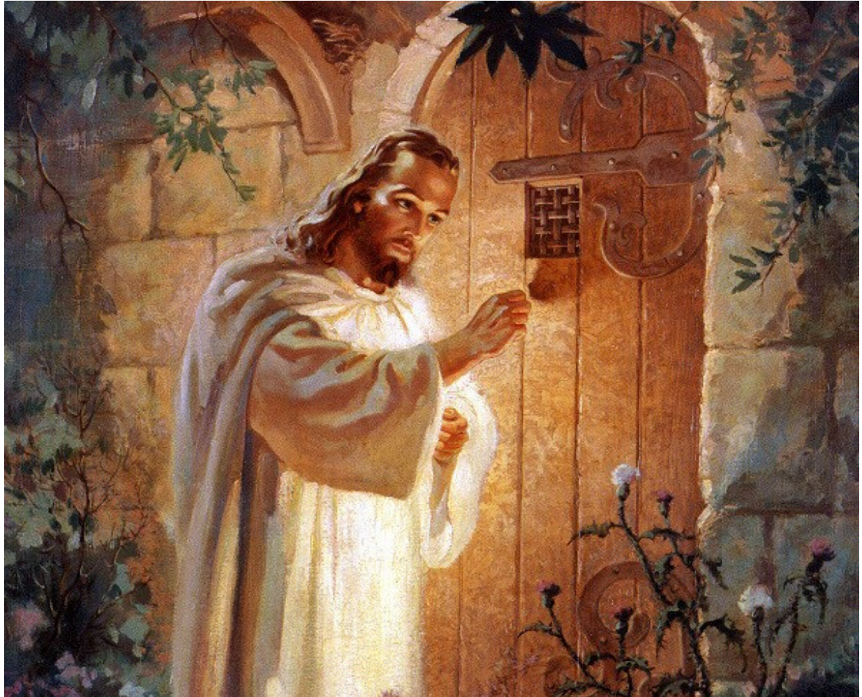
ST. BERNARD CHURCH

“You also must be prepared, for at an hour you do not expect, the Son of Man will come.” - Lk 12:40