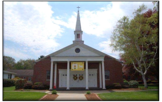
ST. BERNARD CHURCH

Love the Lord your God with all your heart & with all your soul & with all your strength & with all your mind; & Love your neighbor as yourself. Luke 10:27