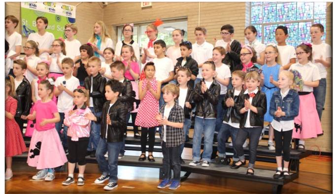
The rockin' and rollin' students who danced and sang their hearts out.