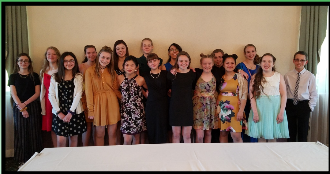
Eighth grade students take a moment to smile before the tears of graduation.

On Saturday, May 11th the eighth grade students along with their parents, guardians, and faculty enjoyed a night of reminiscing, dancing, and good food. The students celebrated their accomplishments and memories from their years at St. Bernard School. This night kicked off their first of many celebrations as they prepare for graduation.