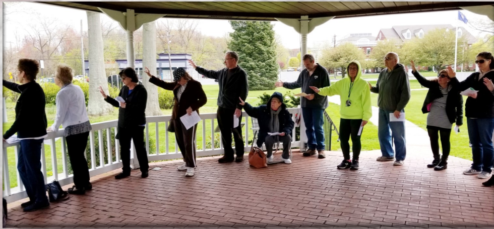
The group extends its hands towards the Town Hall to pray for those working within, and where many important decisions are made that affect our lives in Enfield.

Upcoming days of prayer are planned for Monday nights at the Town gazebo from 7:00 to 8:00 pm on June 17th, July 22nd, and August 19th. All are welcome.