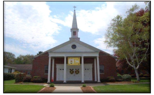
ST. BERNARD CHURCH