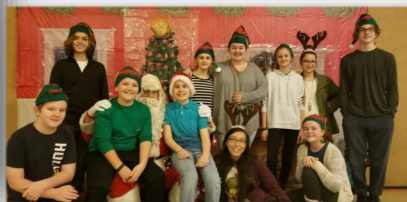
Junior high elves take a moment to enjoy a photo with Santa after all their hard work serving at the breakfast.