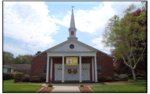
ST. BERNARD CHURCH