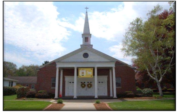
ST. BERNARD CHURCH