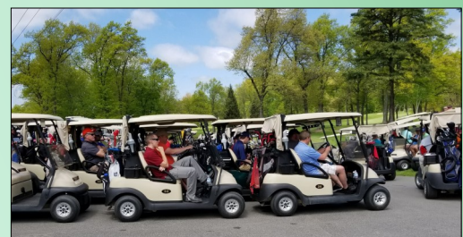
Carts started rolling at noon, full of happy and hopeful golfers on a beautiful day!