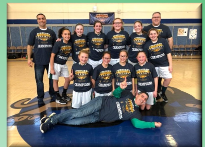
St. Bernard Girls Varsity Team