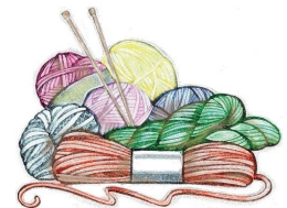
Prayer Shawl Ministry