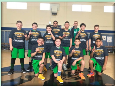
St. Bernard Boys JV Team

Congratulations and best of luck moving forward!