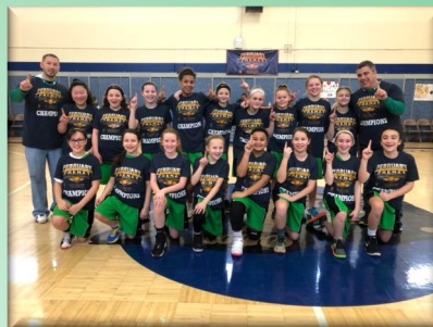
St. Bernard Girls JV Team