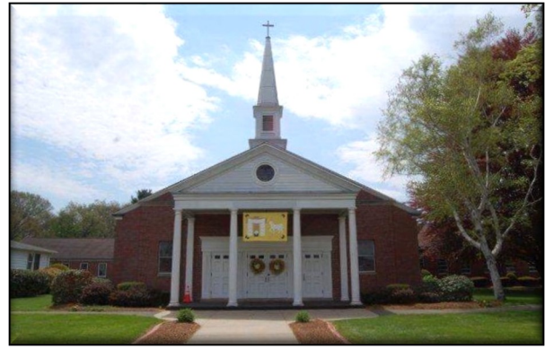
ST. BERNARD CHURCH

If one member suffers, all suffer together.