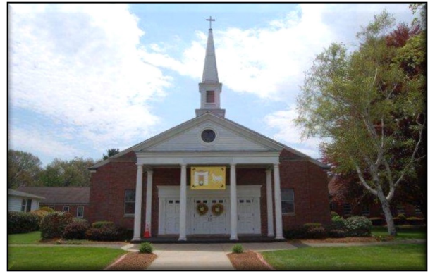
ST. BERNARD CHURCH