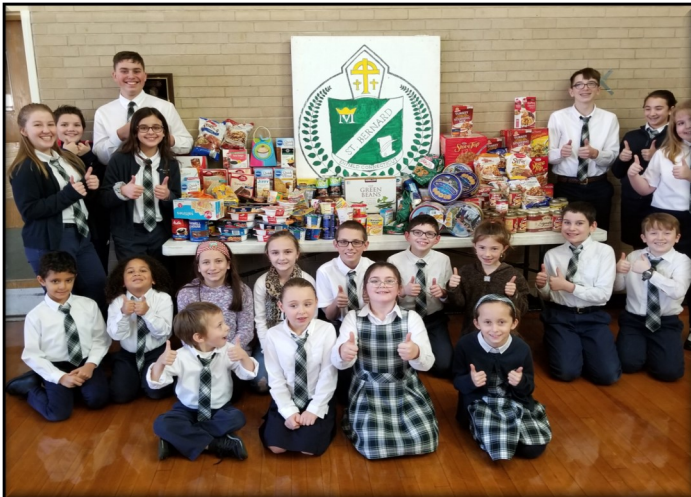
Students from the school recently held a Christmas food drive to benefit the St. Vincent DePaul societies at both churches.