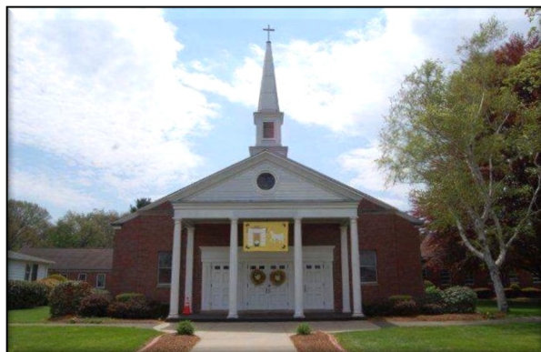
ST. BERNARD CHURCH